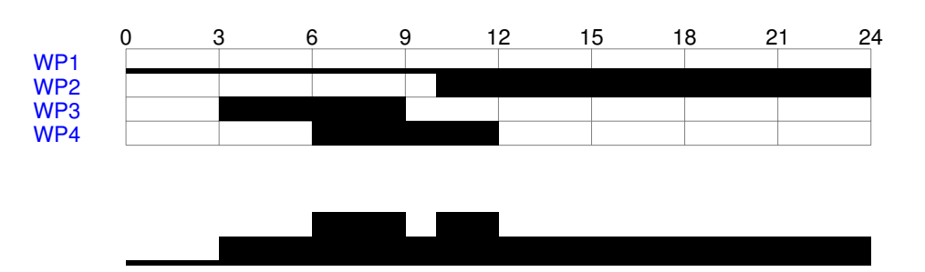
Figure B.1.2: Overview Work Package Activities (lower bar shows the overall effort per month)

2. Show the timing of the different WPs and their components (Gantt chart or similar).